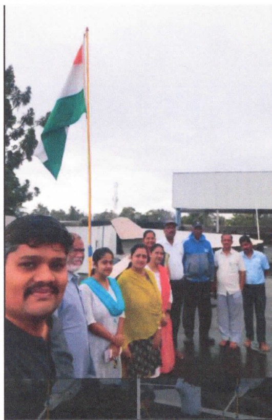
Flag Hoisting on 13 th August 2022